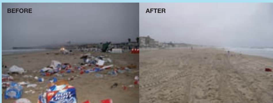
Pacific Beach July 5th, 2007